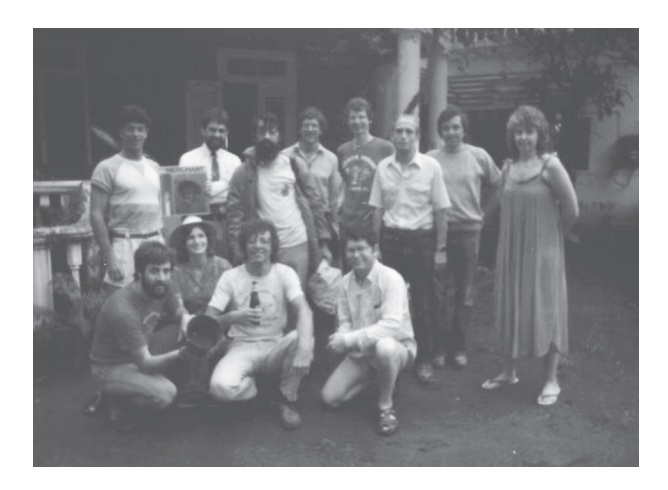
Fig. 10. The first Barbados ever

The method of the 1984 paper was extended and applied to a wide variety of other combinatorial problems in a subsequent paper with Bill Cook and Mark Hartmann [37]. One of the applications was to two objects dear to my heart, the cut and metric polytopes, so I cannot resist including it here. The cut polytope is the convex hull of zero—one vectors defined by the edge sets of cuts in a complete graph. The metric polytope its natural relaxation defined by considering all triangle inequalities on the same set of variables. An important class of facets of the cut polytope (see for example [50]), called pure hypermetric facets by Michel Deza, are defined for any complete graph H on 2t+1 vertices by