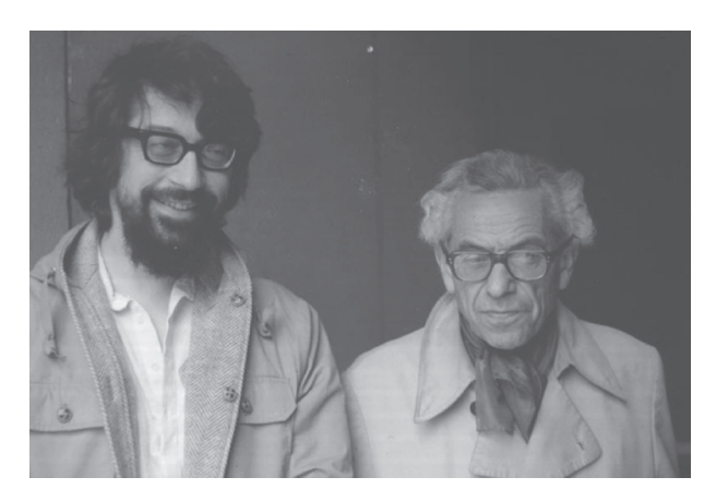
Fig. 3. With a co-author

almost complete", which showed that a certain sufficient condition for hamiltonicity, touted by its author at a Florida meeting as superior to existing conditions (such as Vašek's degree condition) because high density was not required, was satisfied only by circuits or extremely dense graphs.