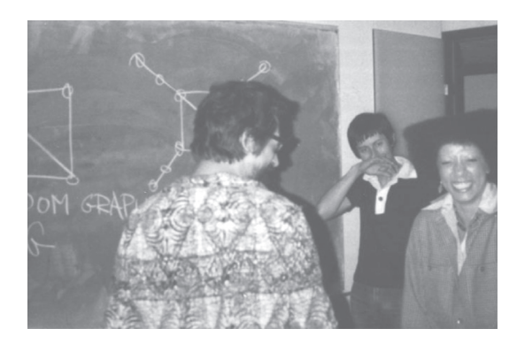
Fig. 6. With a visiting speaker

walls of a polygonal art gallery (and has prompted much research), and constructed the smallest triangle-free 4-chromatic 4-regular graph, a beautiful graph now known as the Chvátal graph [15] (Fig. 6):