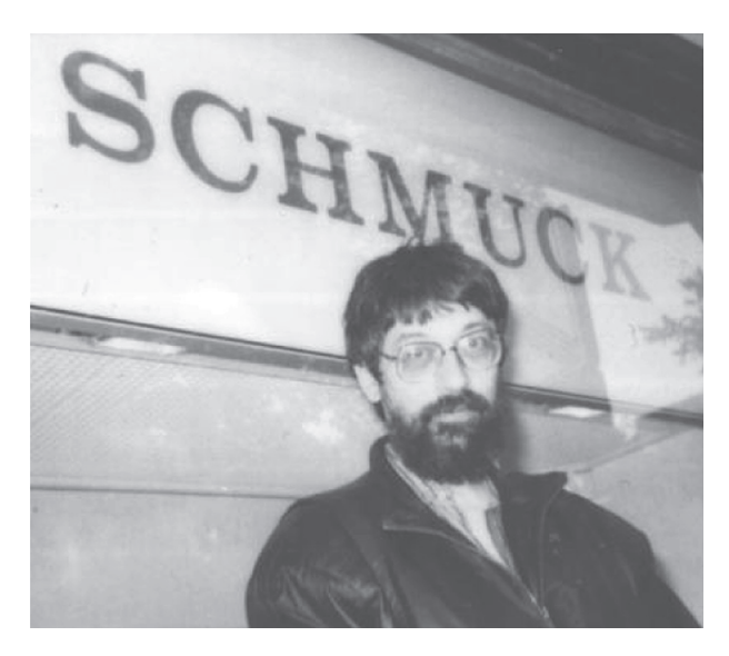
Fig. 1. A short introduction