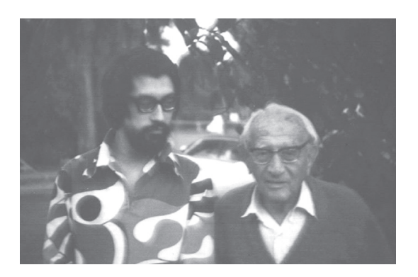
Fig. 5. With George Polya

In a typically extravagant gesture, Vašek [42] offered $10.00 for a proof or counterexample. (His coauthors of this collection of combinatorial problems, David Klarner and Donald Knuth, wisely appended the disclaimer "All cash awards are Chvátal's responsibility". The reward offered for settling his conjecture on toughness was somewhat more generous.) The hereditary hypergraph conjecture has been the topic of some twenty articles (see http://www.users.encs.concordia.ca/ \sim chvatal/conjecture.html).